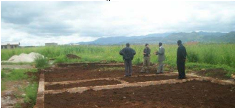
From this to this needs funds...

Beulah Heights School, Mutare. A new school to serve a high density population area of 25,000 people which does not have its own Secondary school. Because of the state of the economy in Zimbabwe, funding had dried up almost totally. Local businesses are struggling to exist are now unable to help fund the project. Aid2Africa.co.uk has provided funding to complete the classroom block and will fund the building of toilets at the school.