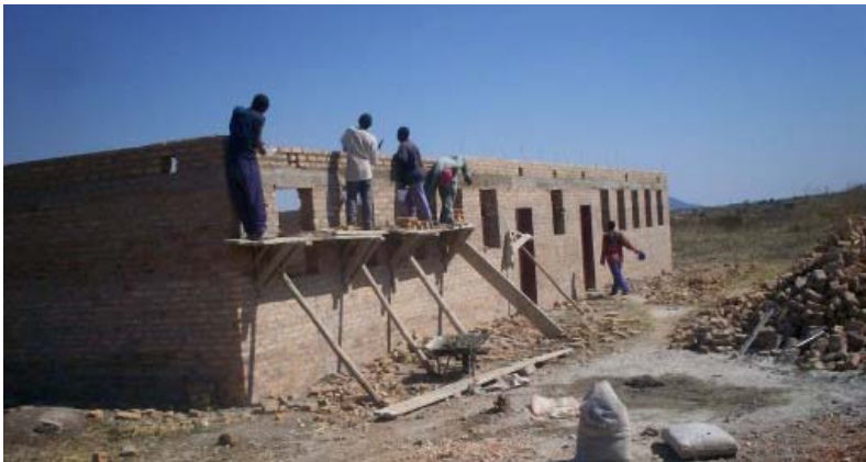
Funds have gone to pay for the roof which should be completed by the end of August.

Follow progress on the website. New photos of the building are being added most weeks.