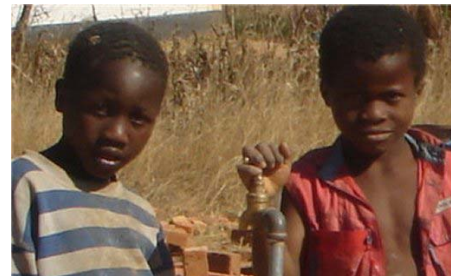
Tap in place

Visit our website at www.aid2africa.co.uk to get a fuller picture of the work done so far and plans for the future and how you can get involved.