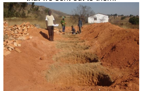
Toilets under construction – will be ready for use at the start of the new term in September