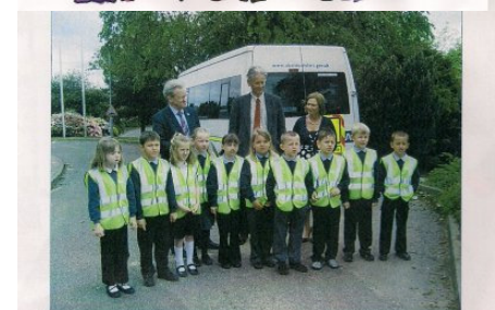
Some of the boys and girls from P3 attended the launch of the new Scottish Road Safety Strategy at Woodhill House, Aberdeen. They met Stuart Stevenson, the Minister for Transport (top left) and other local councillors. They even sang their Stop, Look, Listen and Think rap!

1.7m Zimbabwean children are orphans, the highest per capita figure in the world. at least 60% of children in rural areas suffer from malnutrition. at least 160,000 children under 14 have HIV. OVER 50% of Zimbabwe's population are under the age of 18. More than 1 in 10 children die before their fifth birthday - up over 30% in ten years