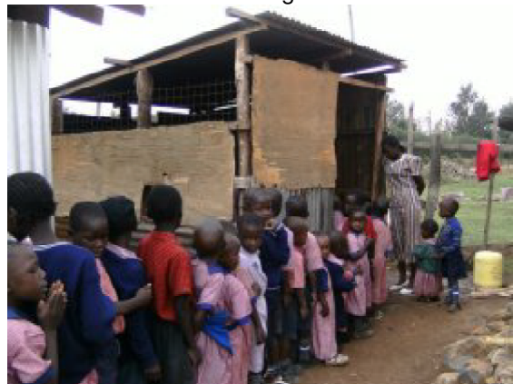
The old kitchen, now long gone.