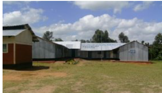
the new kitchen (left) and new classrooms

A mug sweet porridge for breakfast a lunch which is usually some combination of potatoes, rice and beans. For many of children, this is all they will get