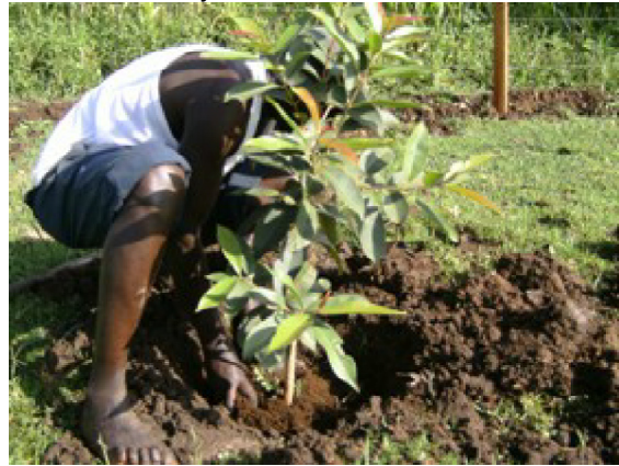
Fruit trees being planted