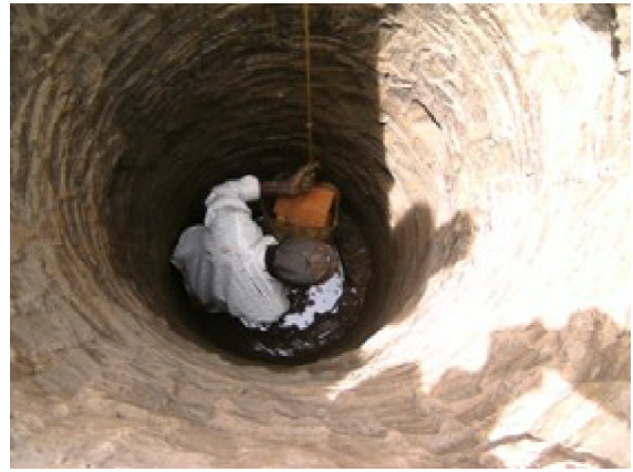
the well at the school being dug

In Zimbabwe our work is mainly paying school fees for children. We have also provided other material support such as furniture, books, toys, clothing, toilets, water supplies and even classrooms, working with eleven schools over the past three years. The charity also oversees and advises two other projects in Africa. One is in Tanzania, the other, which is just about to start, is in a different area of Zimbabwe to where we currently work..