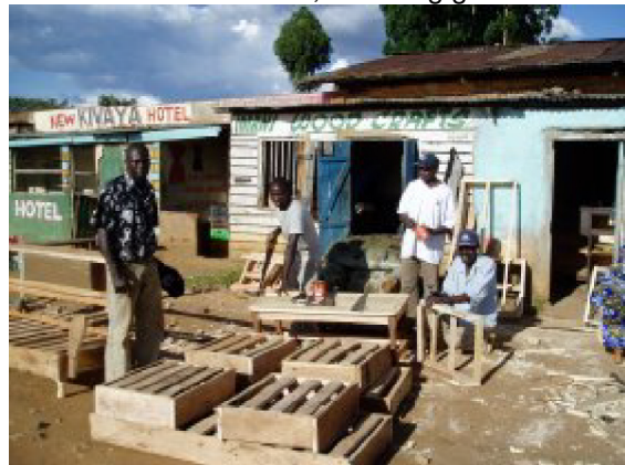
Local carpenter who make the desks and other furniture for the school