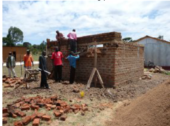
The local builders working on the new kitchen