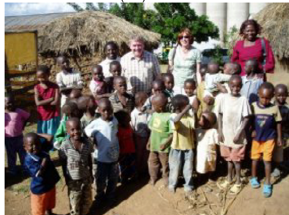
Kids in the slum who we are now giving a chance of an education to